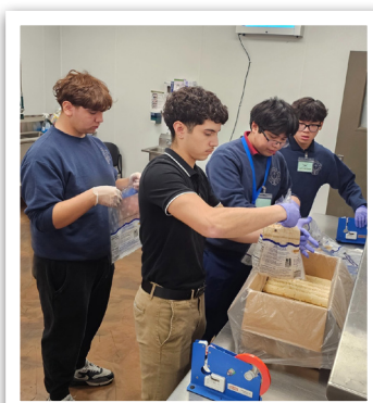
▲ SLS HS students help prepare a meal at CSK

are also highlighting the St. Lawrence Seminary senior class who came to Capuchin Retreat for their senior retreat and took a day to come down to the Soup Kitchen and volunteer at our Meldrum and Conner Kitchens and the Services Center.