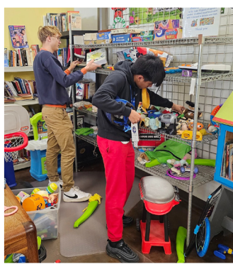
▲ Students serve in the Capuchin Services Center