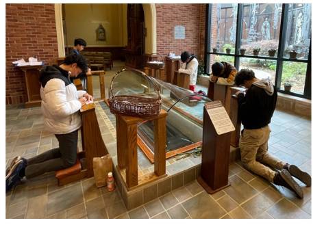
▲ SLS students pray at the tomb of Blessed Solanus Casey