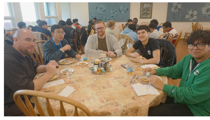
▲ St. Lawrence Seminary High School students dine together at the Capuchin Retreat Center.

While attending the retreat, students participated in traditional retreat activities, which included morning and evening prayer, three input mass sessions, and some alone time.