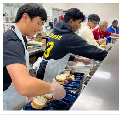
▲ SLS students help prepare a meal for guests