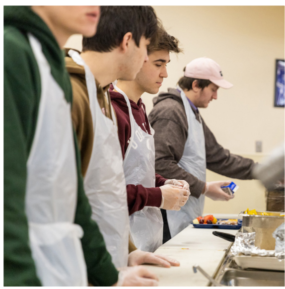
▲ ► Students from U of D Jesuit High School & Academy prepare meals for our guests.

Volunteers of all ages are a vital part of Capuchin Soup Kitchen. We often host students from local high schools. They volunteer regularly and join the soup kitchen's staff and other volunteers in small groups to serve the community. As part of a class curriculum at University of Detroit Jesuit High School & Academy, students are assigned various outreach and service opportunities in the community, and the Capuchin Soup Kitchen is one of them.