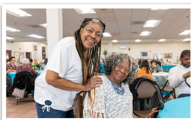
▲ Friars & staff create a positive environment for CSK's guests