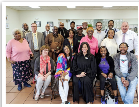
▲ Participants of the SOCD with SOCD and CSK staff

Besides these services, we partner with many different organizations to help our guests overcome the hardships and struggles they experience. One of the organizations that we