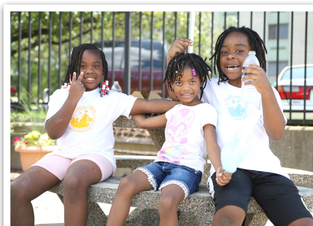
▲ Summer campers take a break from the fun to hydrate