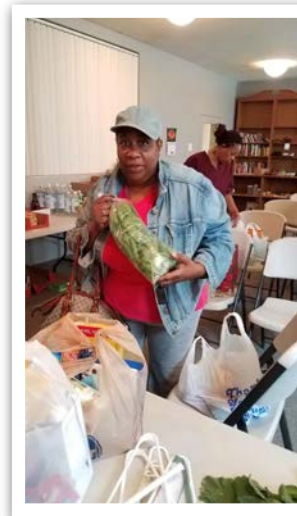
▲ Guests of DGM Detroit select food in the pantry.