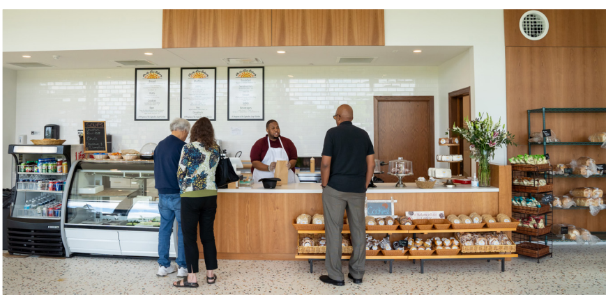
▲ Visitors to the Solanus Casey Center enjoy breakfast or lunch Tuesdays through Saturdays, 9:30 am to 4:00 pm. Baked goods are also sold at parishes on the weekend. To find a menu plus the schedule of parish sale locations visit: https://ofmcap.cc/OTR-Bakery .

Support our ministry: www.cskdetroit.org/more-than-about-food/ or by mail to Capuchin Soup Kitchen, 1820 Mt. Elliott, Detroit, MI 48207